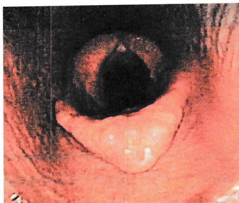
Larynx at full abduction

If you have any further questions regarding this report, please do not hesitate to contact the office on +61 437 420 581.